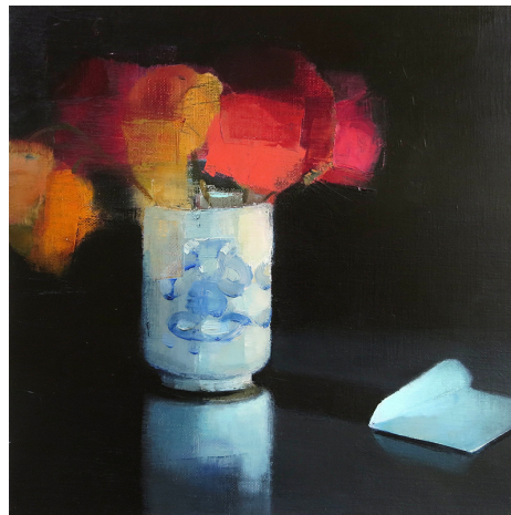
Hear No Evil , 2014 Oil on linen, 12 x 12 inches

engages the viewer to imagine their own. By staging the objects London creates dramatic vignettes in miniature, which feel reminiscent of portraiture. Similarly, her portrait-like paintings employ specific visual keys to enhance each narrative.